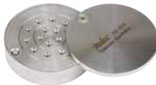
62-309 Membrane Tack Storage Box (Membrane tacks not included)