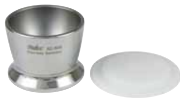
62-308 Mixing Cup with Lid