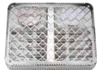
62-311 Kit Wash Tray with Lid (Contents not included)