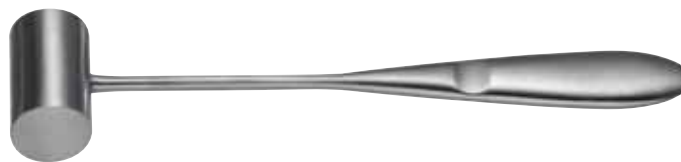
62-310 Mallet 16.5 cm