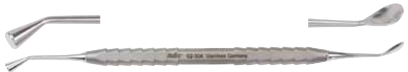
62-304 Double-ended Sinus 7 Instrument